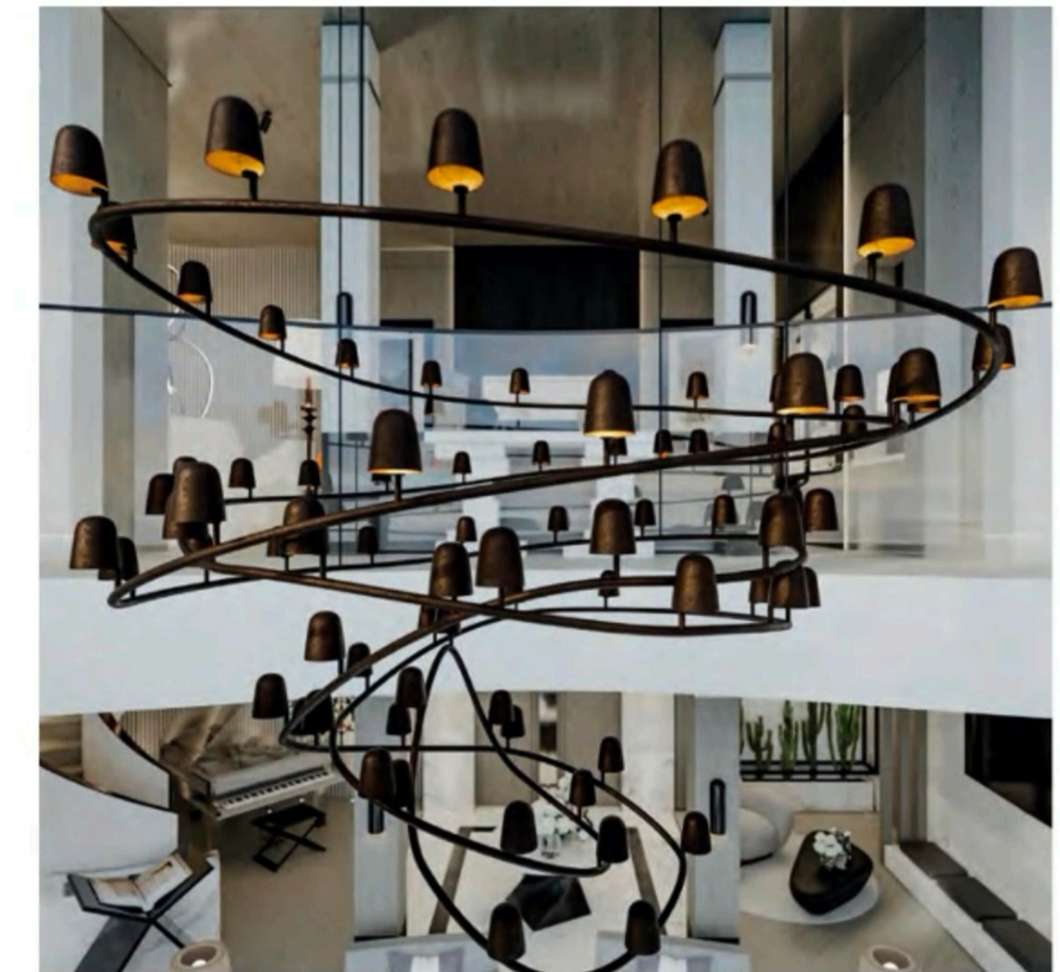
Use lighting to make a statement

touches of marble in other areas of your home, such as marble shelving that can be used to display ornaments and art. The key is to contrast the marble with concrete and more down-to-earth finishes so it's not too over the top! Visit: www.kellyhoppeninteriors.com