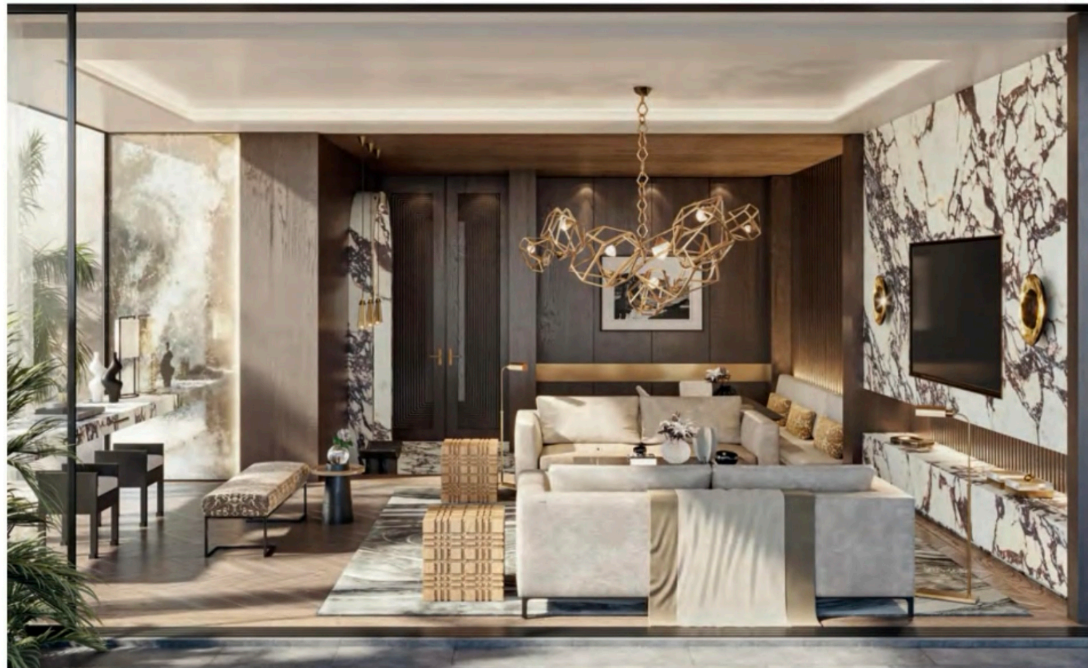
Marble isn't just for kitchens and bathrooms

'Art has played a huge factor, with people collecting photography, →→→