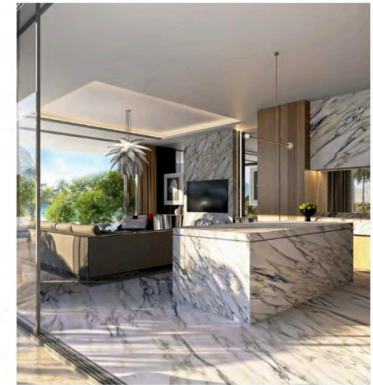
Marble is Hoppen's number one hard finish

'Marble is the number one hard finish, but now with powerful markings – unlike the past few years where it has been all about neutral. Marble is not just for kitchen worktops and bathroom