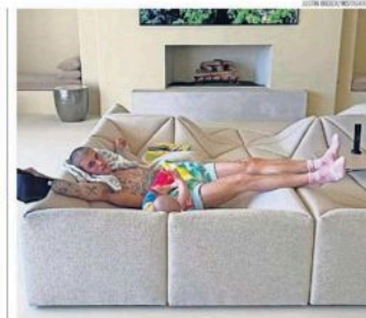
Top: the Malvern from Oak Furnitureland. Justin Bieber on his Dune Ensemble, above

The American maximalist Jonathan Adler has created the Futura system, with armless pieces and corner units for endless possibilities (£1,750 for the slipper chair). The 102H High Back Sofa from the Australian brand King Living is the stuff viral Instagram content is made of, with curves,