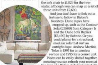
The Tolco range from Andrew Martin, above. Below: King Living's 1978 High Back Sofa

sweeping lines and a high backrest. Not only can the modules be mixed and matched, but the armrests can be removed too. Prices range from £729 for the sofa chair to £1,029 for the two-seater, although you can snap up a set of three units from £2,690.