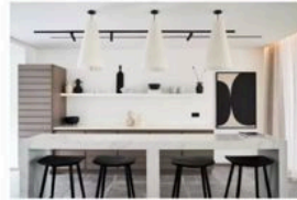
The hotel is the epitome of modern luxury

Each villa has been lovingly designed by Kelly Hoppen