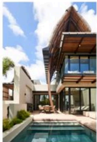
There's always space to lounge beside the hotel's luxurious pool

Each villa has been lovingly designed by Kelly Hoppen